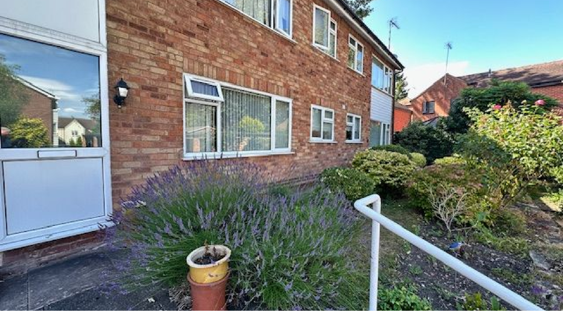
DeMontford Court, High Street, Henley-In-Arden, B95 5HX