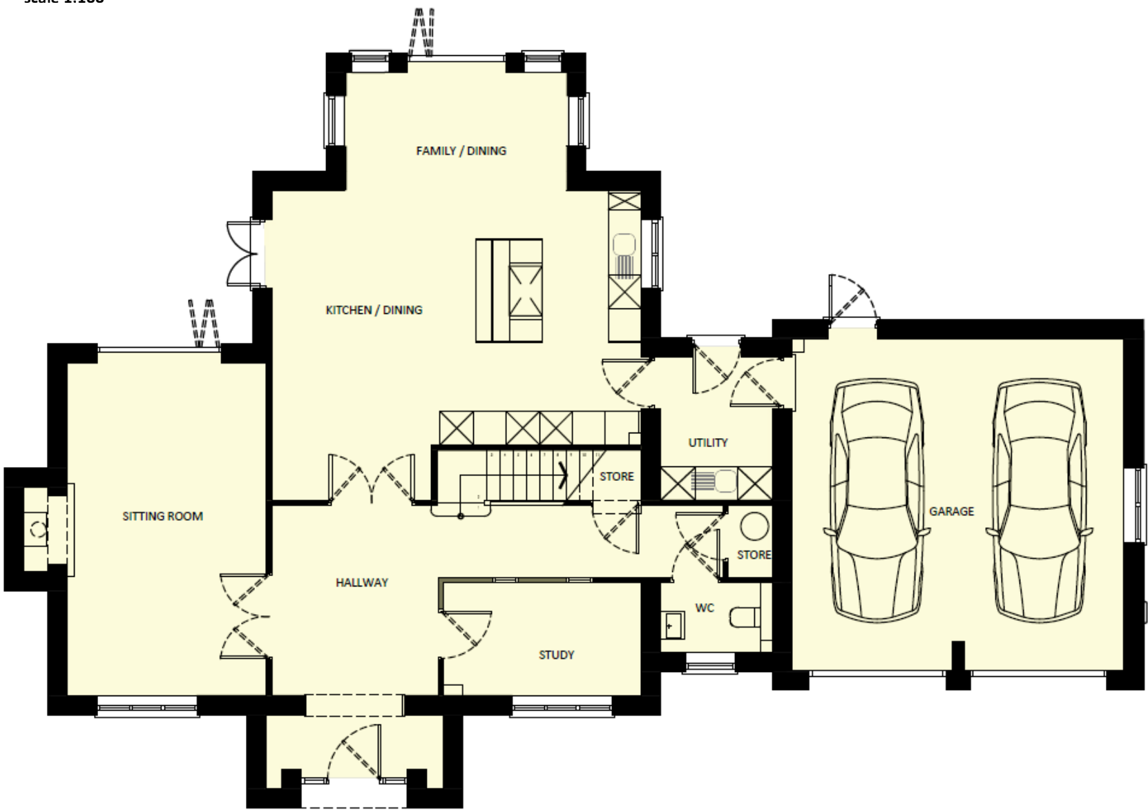
Proposed Ground Floor Plan Scale 1:100