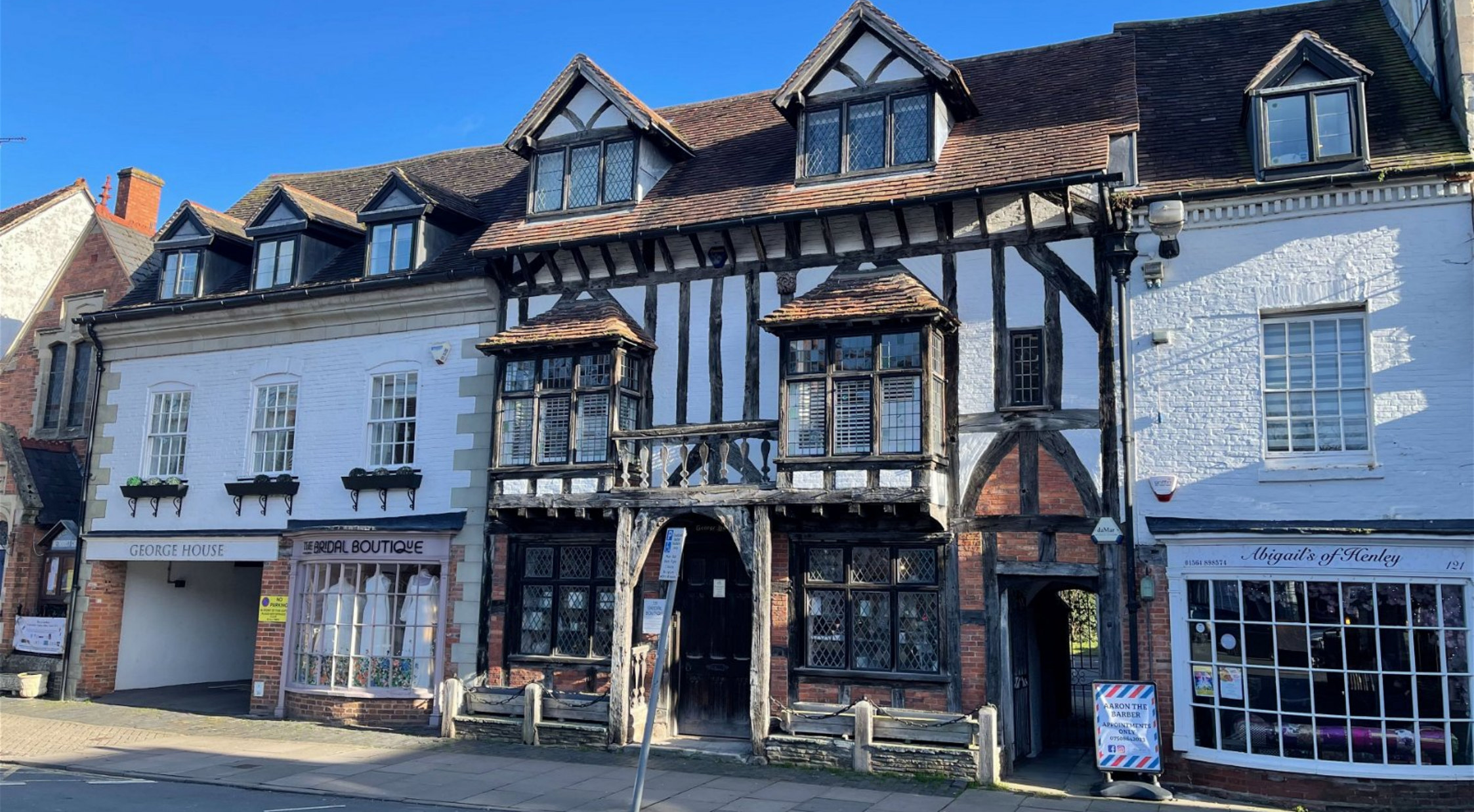
GEORGE HOUSE, HIGH STREET, HENLEY IN ARDEN