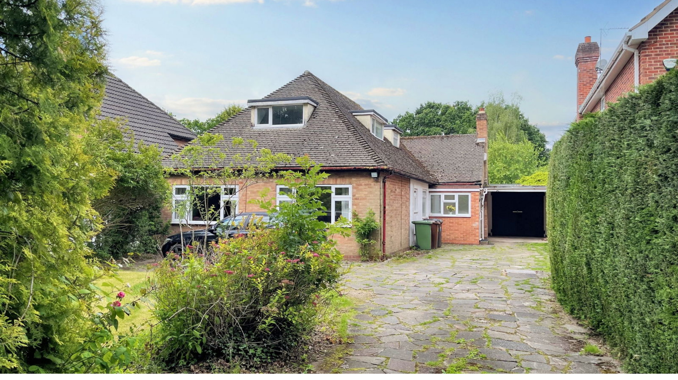
Fulford Hall Road, Tidbury Green