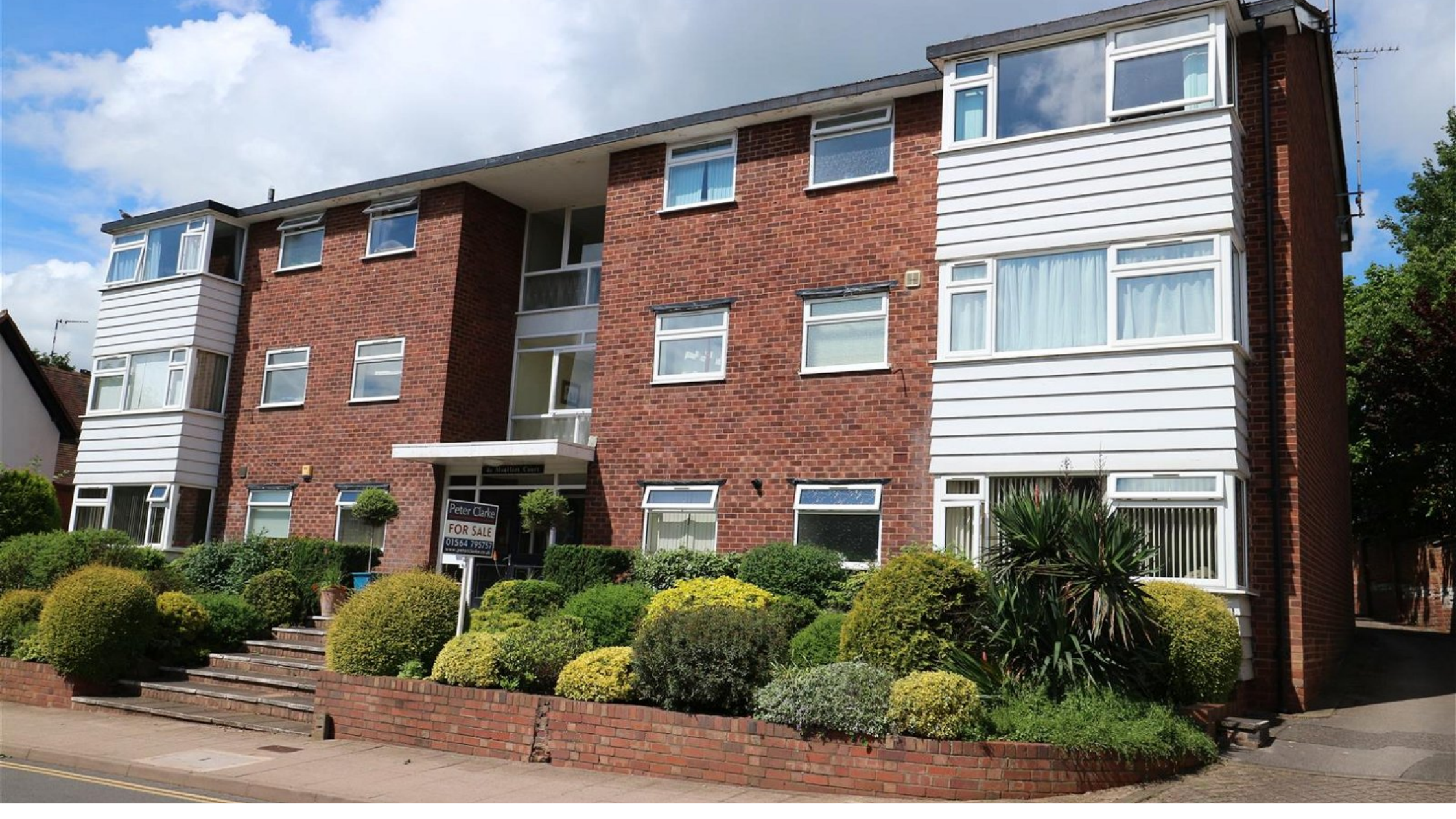
High Street, Henley-In-Arden